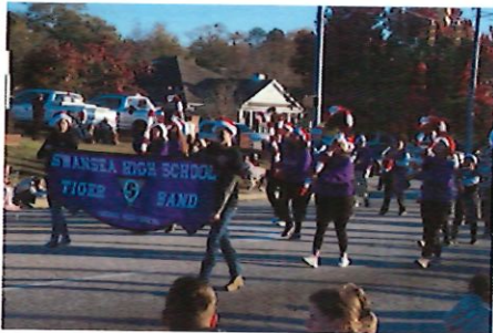
Above: Swansea HS Tiger Band Below: Trackless Train