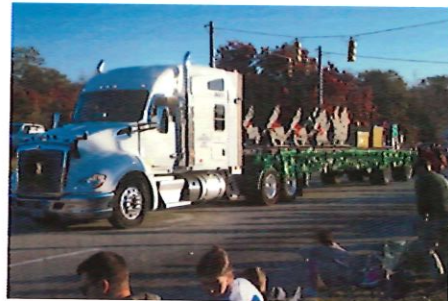
Above: Nucor float Below: Swansea UMC fishing boat float